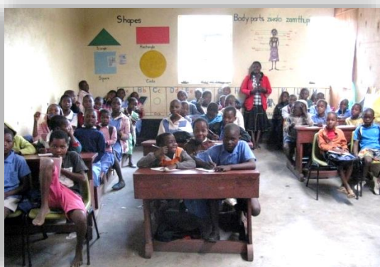
Standard 4 – September 2015