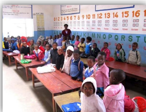
Standard 1 – September 2015

Below are some recent photos of the classrooms. Standard 3 is the one on the cover of this newsletter.