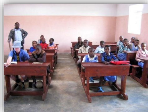
The new Grade 6 class started on the 7th Sept. 2015.

The new two-classroom school building, with office, storeroom and toilets was officially opened on 4th September 2015 by the Blantyre District Commissioner for the Malawi Government Education Department, who as guest of honour, cut the ribbon and opened the doors to the classrooms. The ceremony was opened in prayer and the new school building dedicated to the glory of God and for the benefit of orphans and vulnerable children (OVC) and the Ngumbe community.