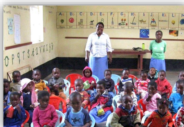
Kindy/Nursery Class – September 2015

“Be joyful always; pray continually; give thanks in all circumstances, for this is God’s will for you in Christ Jesus”. (1 Thess. 5:16-18)