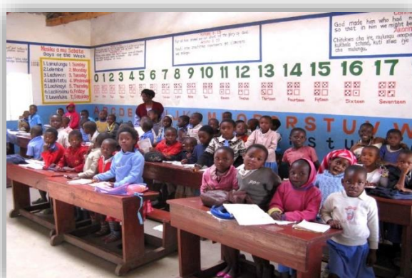
Standard 2 - September 2015