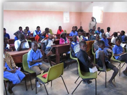
Standard 5 - September 2015