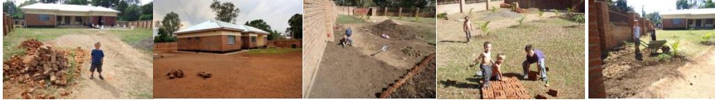
The Orbus house before.