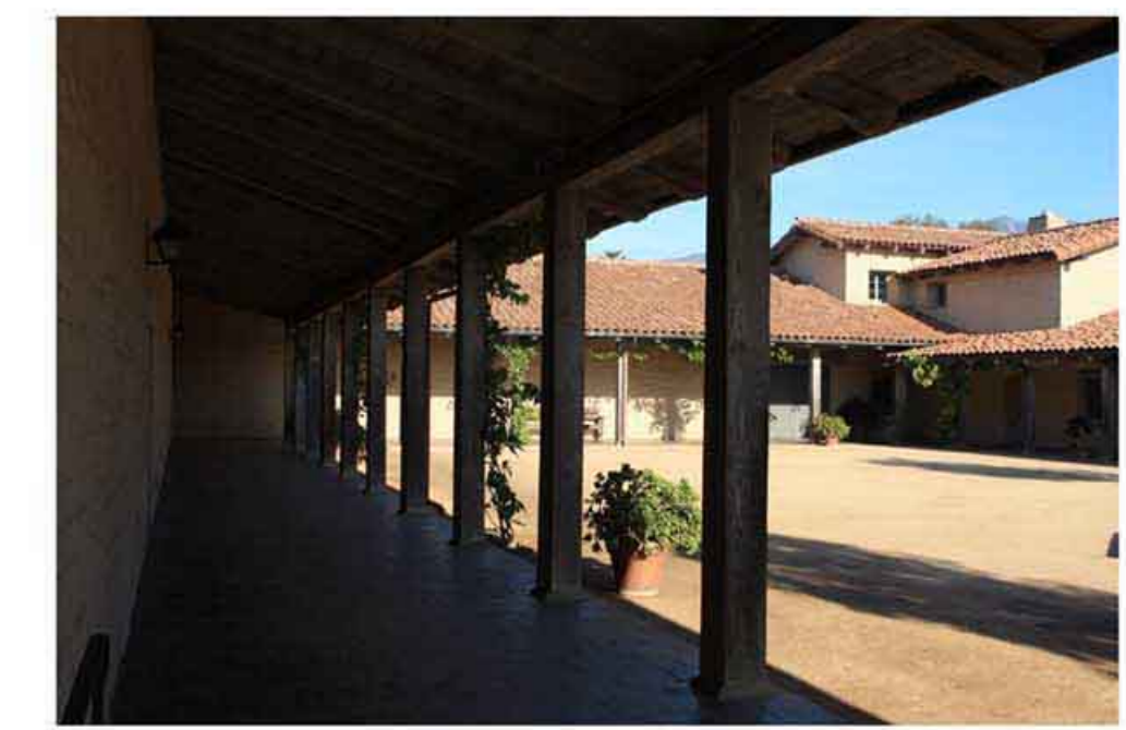
INDICATIVE CHARACTER OF CENTRAL COURTYARD