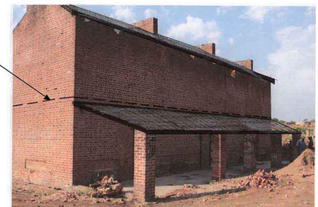
LINE OF NEW INTERNAL SECOND FLOOR